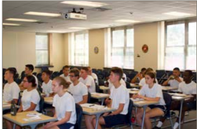
The new 4/C receiving classroom instruction on customs and courtesies

With the arrival of a new semester, we continued our annual ritual of training and indoctrinating our new freshmen into the NROTC battalion. Aspiring freshmen reported to the O'Keefe building bright and early on a Tuesday morning for a quick in brief from the Commanding and Executive Officers, then immediately hit the ground running. New Student Orientation (NSO) continued for 4 days, all ran out of the O'Keefe building at Georgia Tech. Training days included events such as an initial PFA/PFT, swim PT at the CRC, and rifle and pistol familiarization training at the range at