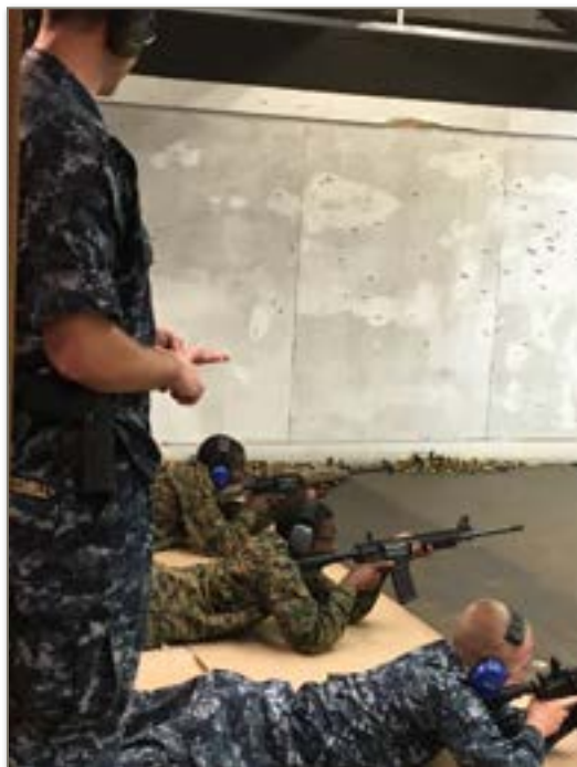
4/C slinging lead downrange at Quickshot Buckhead

Quickshot Buckhead. The freshmen also received their new gear, were trained in basic close order drill, and were briefed on how to succeed in the NROTC battalion.