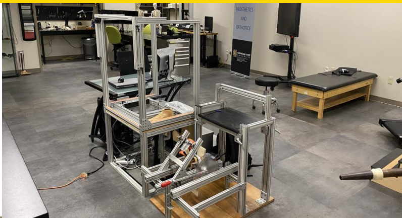
Clinical Biomechanics Lab