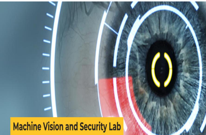
Machine Vision and Security Lab