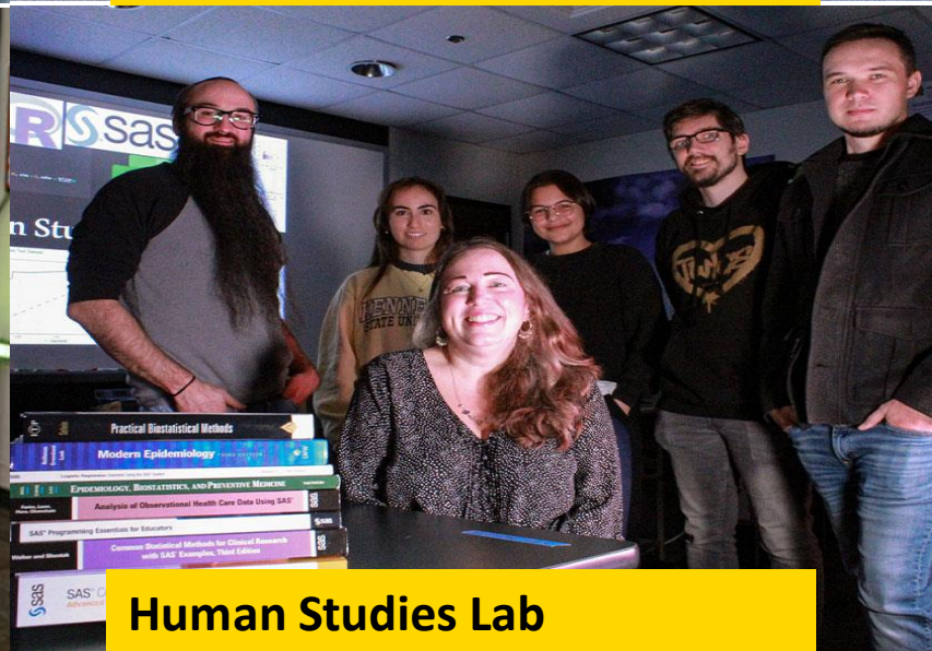
Human Studies Lab