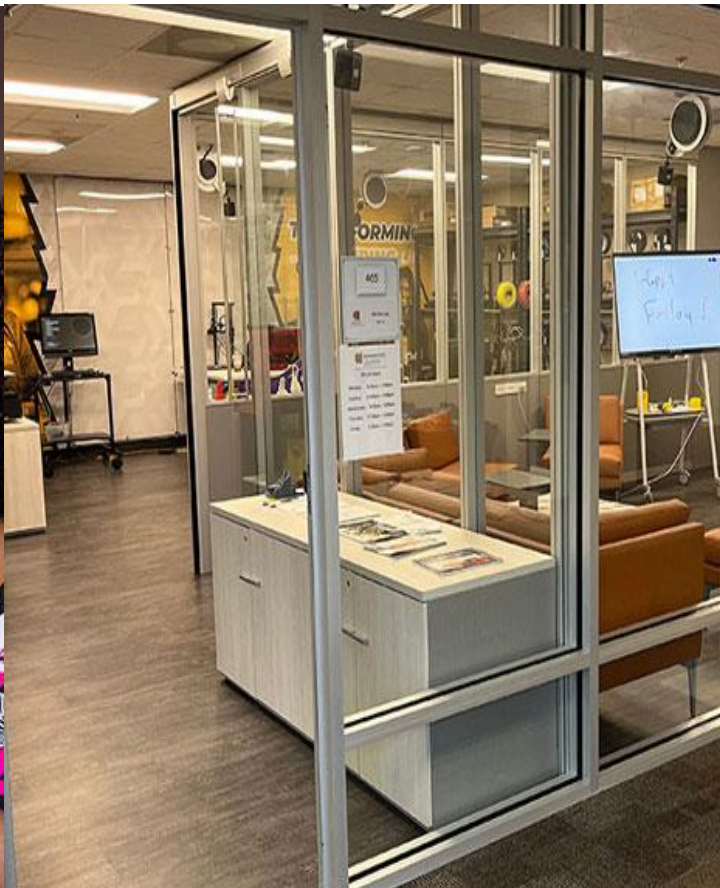
Modular Agile Deployment (MAD) Lab