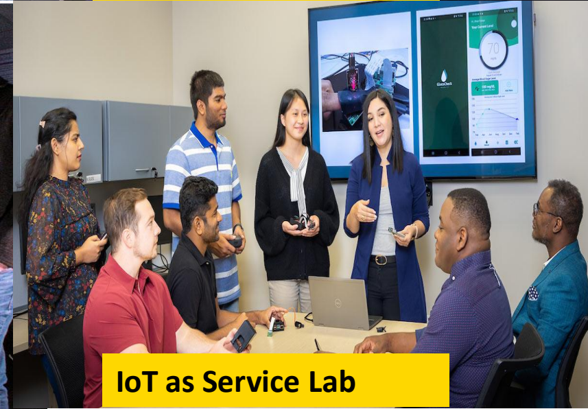
IoT as Service Lab