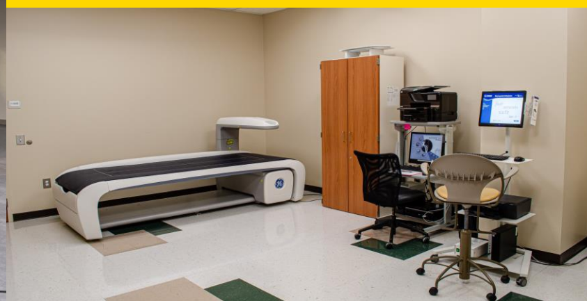
Body Composition Lab