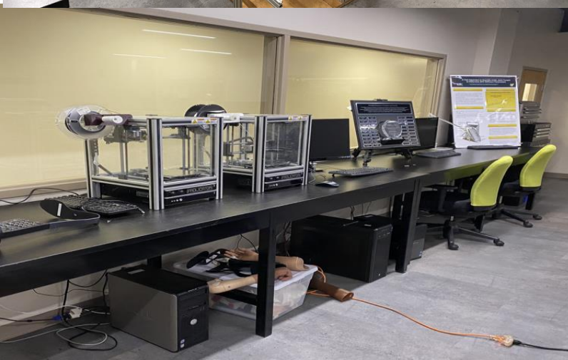
Body Composition Lab