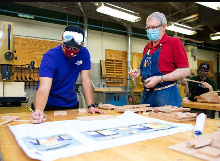
Woodshop + CNC Machines

INNOVATIVE CREATIVITY: USING EXISTING KSU FACILITIES - OPTIMIZATION