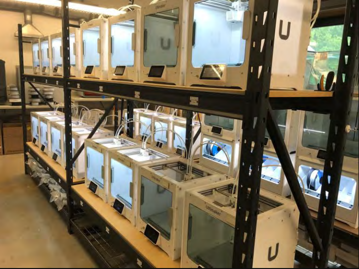
Digital Fabrication Lab, CACM