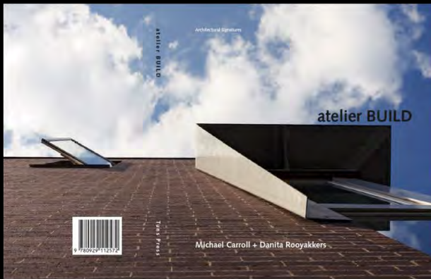
Atelier BUILD, Montreal, Canada