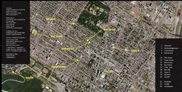
Map of Montreal: Series of Urban Infill Projects