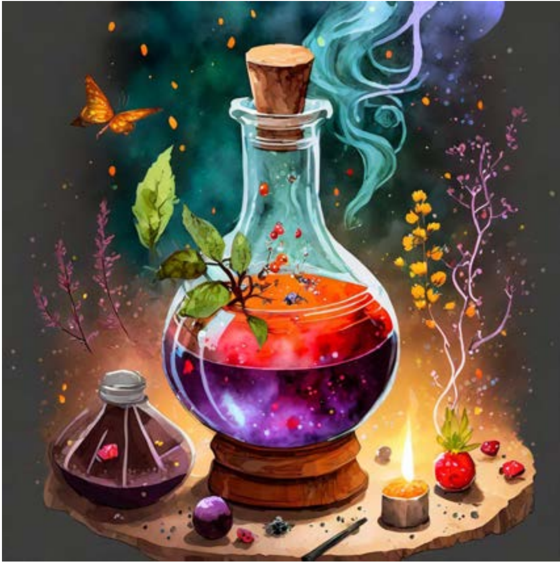
Image source: Adobe Firefly with the prompt, "Create a stylized image of a magic potion."