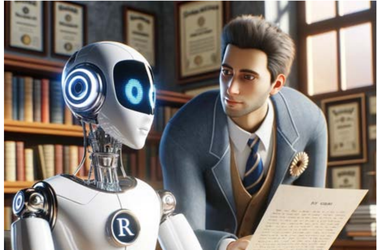
Image source: DALL·E with the prompt, "Create an image of a robot showing a printed essay to their college professor."