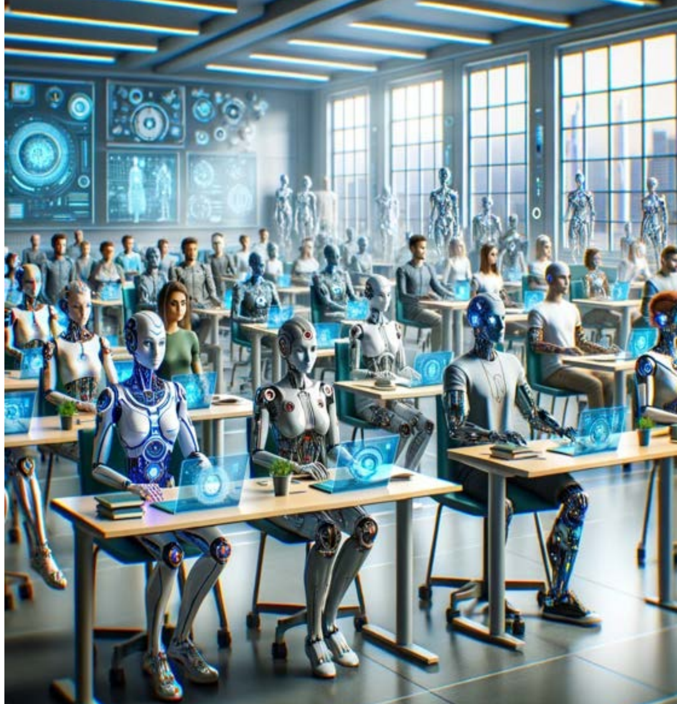
Image source: DALL·E with the prompt, "Create an image of a college classroom with various kinds of cyborgs at students' desks"