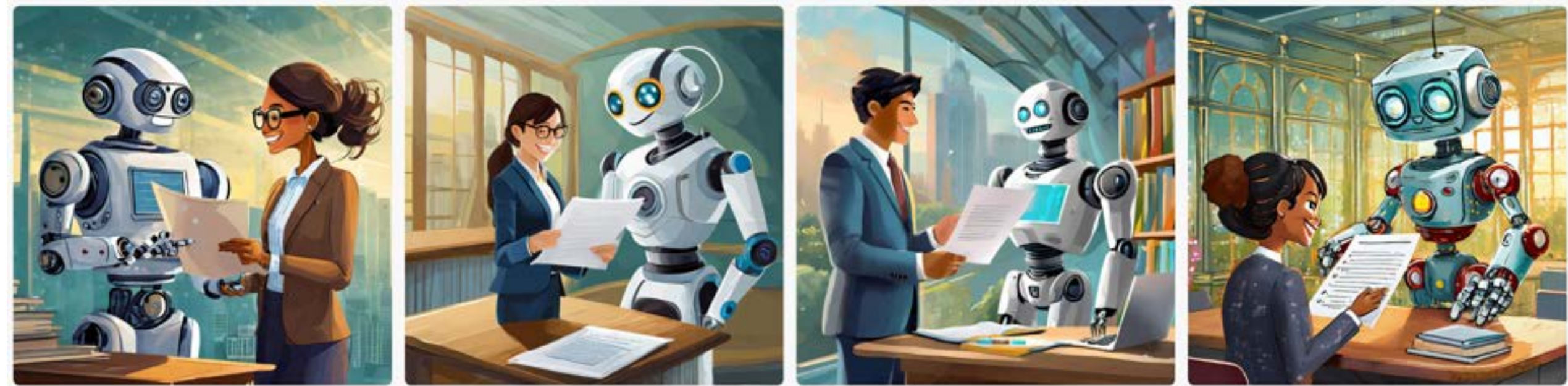
Image source: Adobe Firefly with the prompt, “Create an image of a robot showing a printed essay to their college professor.”

Notice Firefly’s representations of faculty compared to DALL·E’s version (previous slide), which leaned heavily into stereotyping/biases.