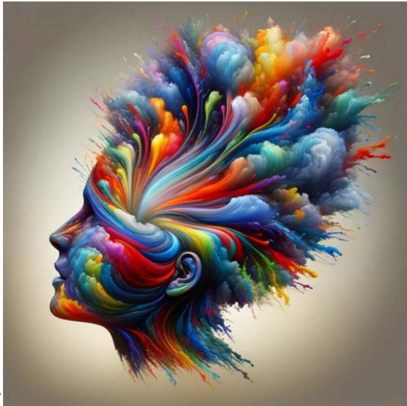
Image source: DALL·E with the prompt, “Create a fun representation of an open mind. Use a variety of vibrant colors.”