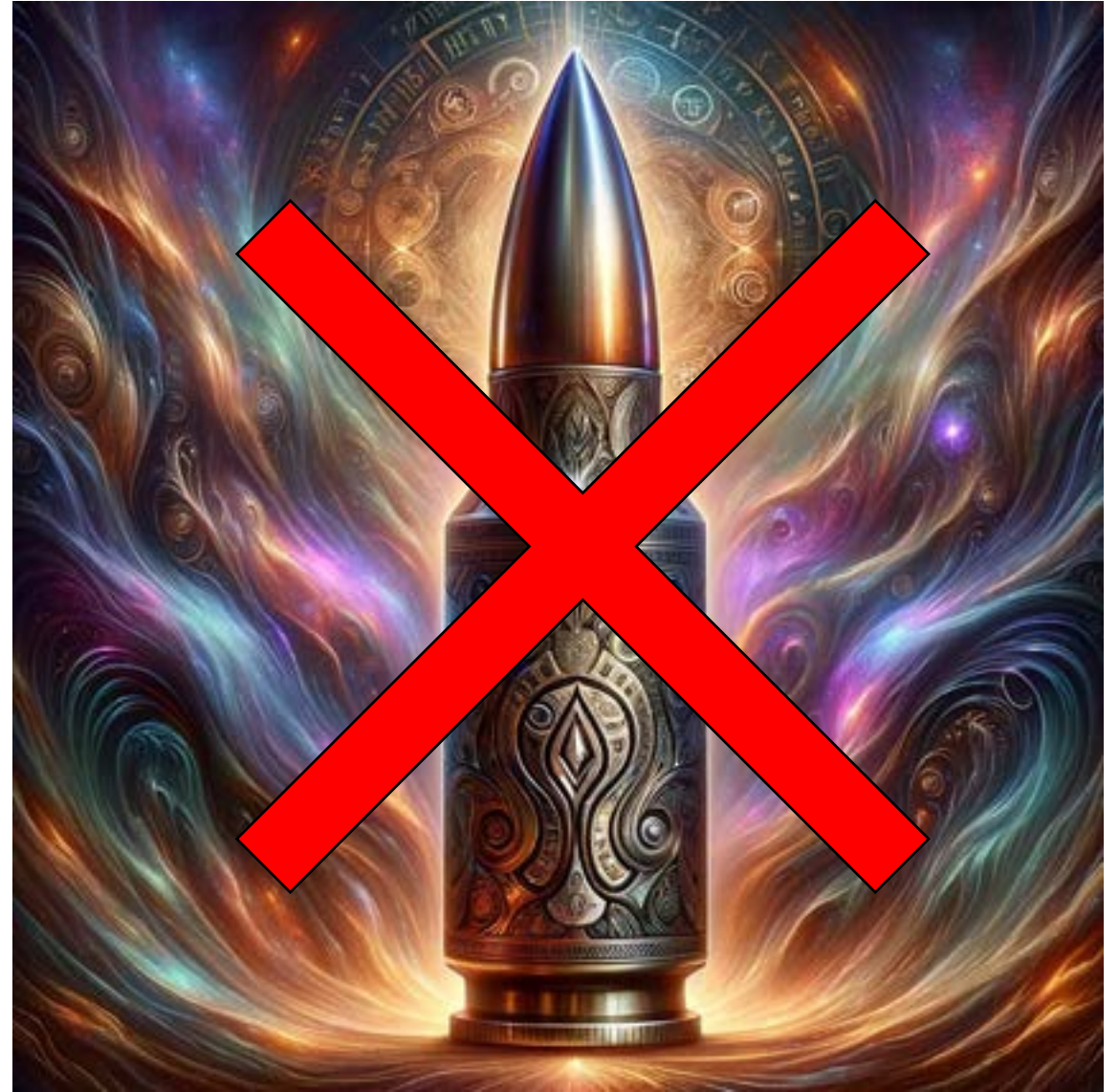
Image source: DALL·E with the prompt, “Create a visually appealing image of a magic bullet”

Our research into detectors didn't show them to be reliable enough given that educators could be making judgments about students with potentially lasting consequences.”