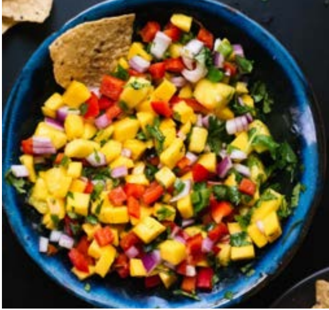
Click above to view our June Recipe of the Month, Fresh Mango Salsa!

Interested in virtually meeting one-on-one with your Employee Well-being Registered Dietitian?