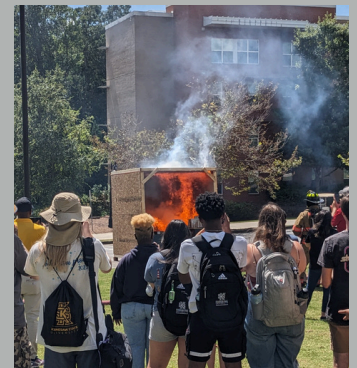
Dorm Burn | 1:30PM