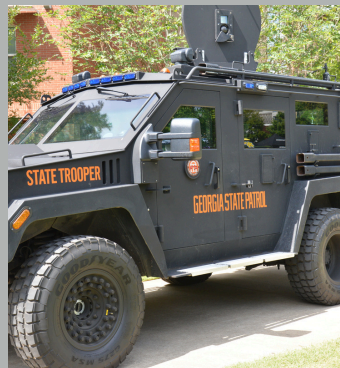
Georgia State Patrol