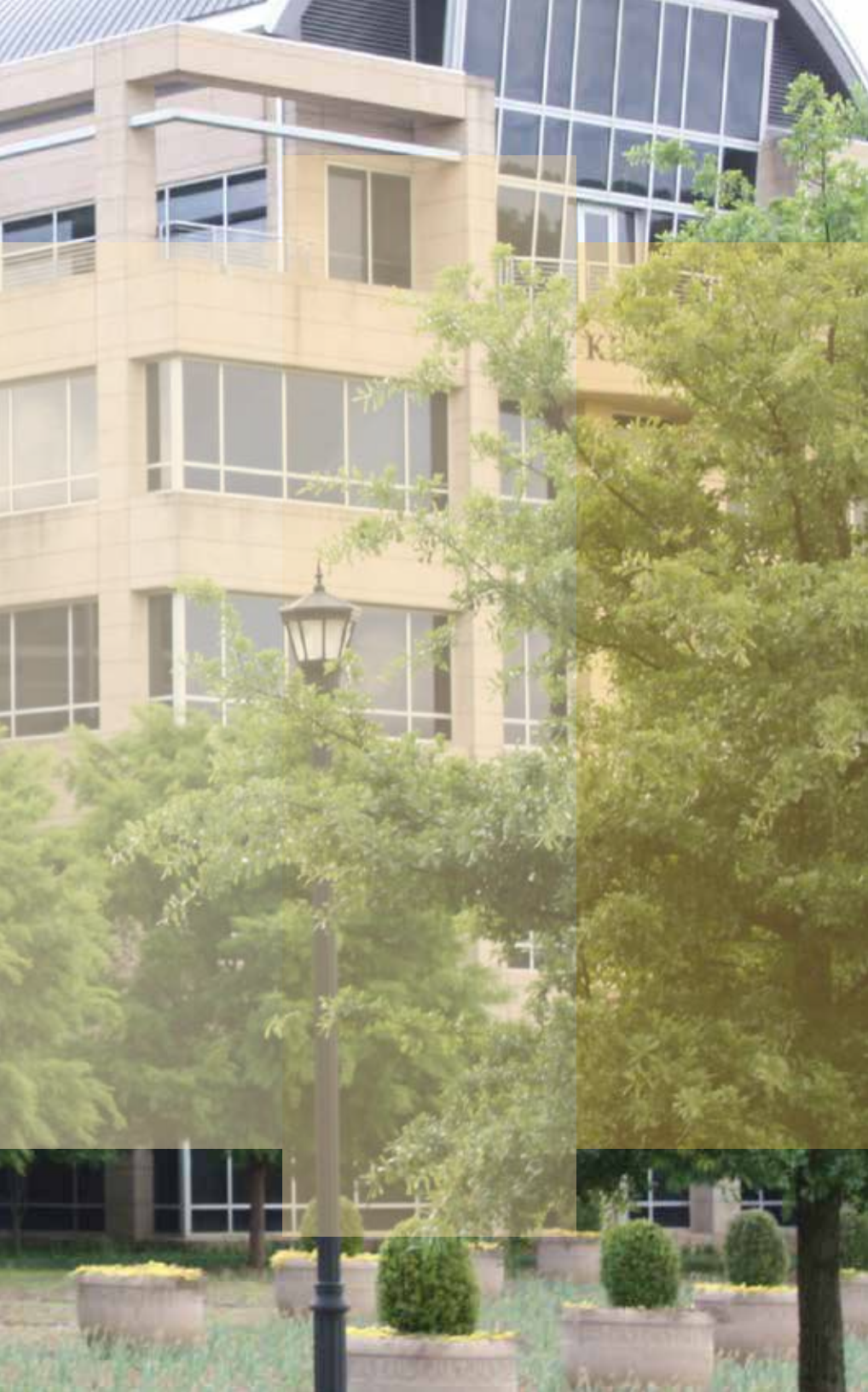
Table of Contents Bagwell Annual Report 2012–2013