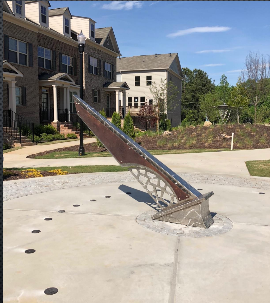
GATEWAY PARK SUNDIAL, STAINLESS STEEL, CORTEN STEEL, CAST BRONZE, 2018