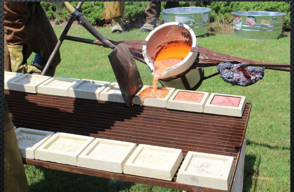
Below: Molten iron being poured into scratch molds carved by the community