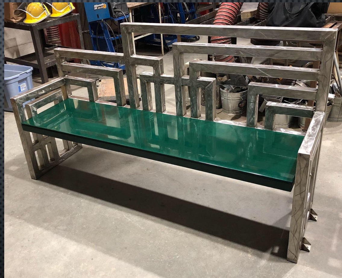
CARRIE MCDANIEL STAINLESS STEEL, POWDER COATED STEEL