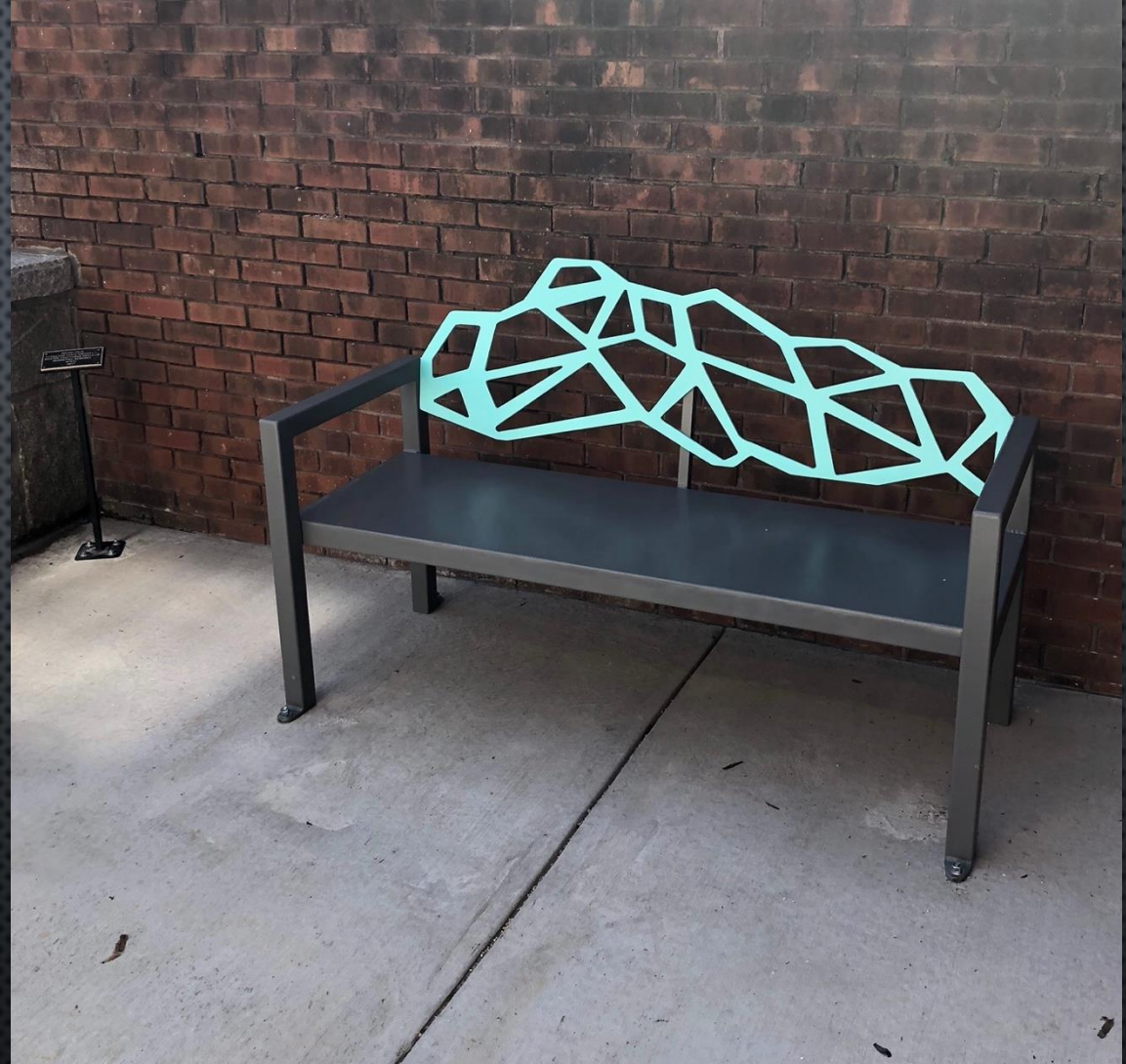
MEGAN PACE, GEOMETRIC BENCHES, PAINTED STEEL, 2017. INSTALLATION VIEW OF BENCHES OUTSIDE OF CITY HALL