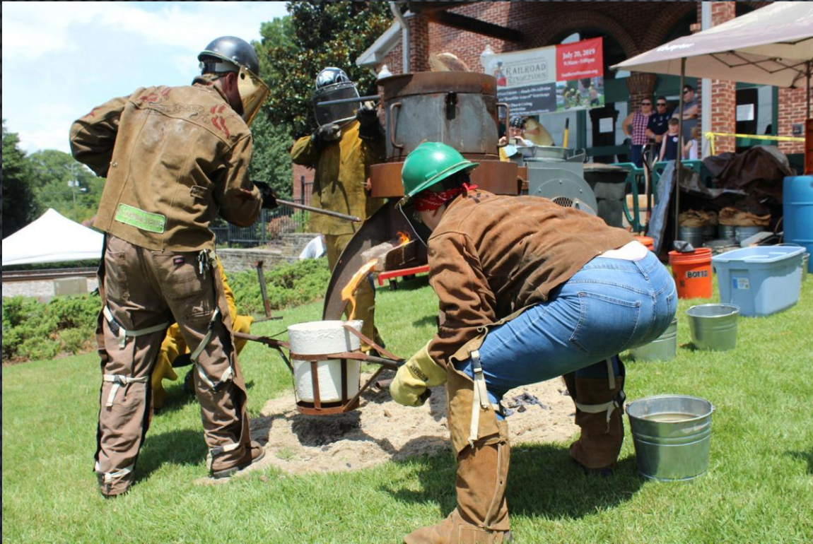
Left: The iron furnace being tapped