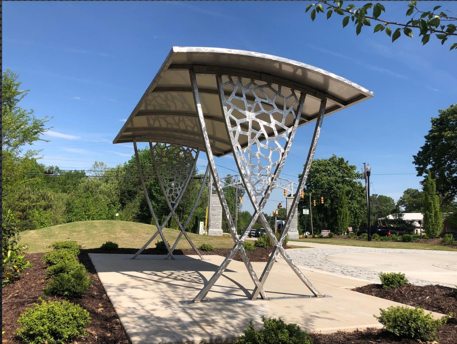
GATEWAY PARK SHADE STRUCTURE, STAINLESS STEEL, 2019. Design by Jonathan Copeland