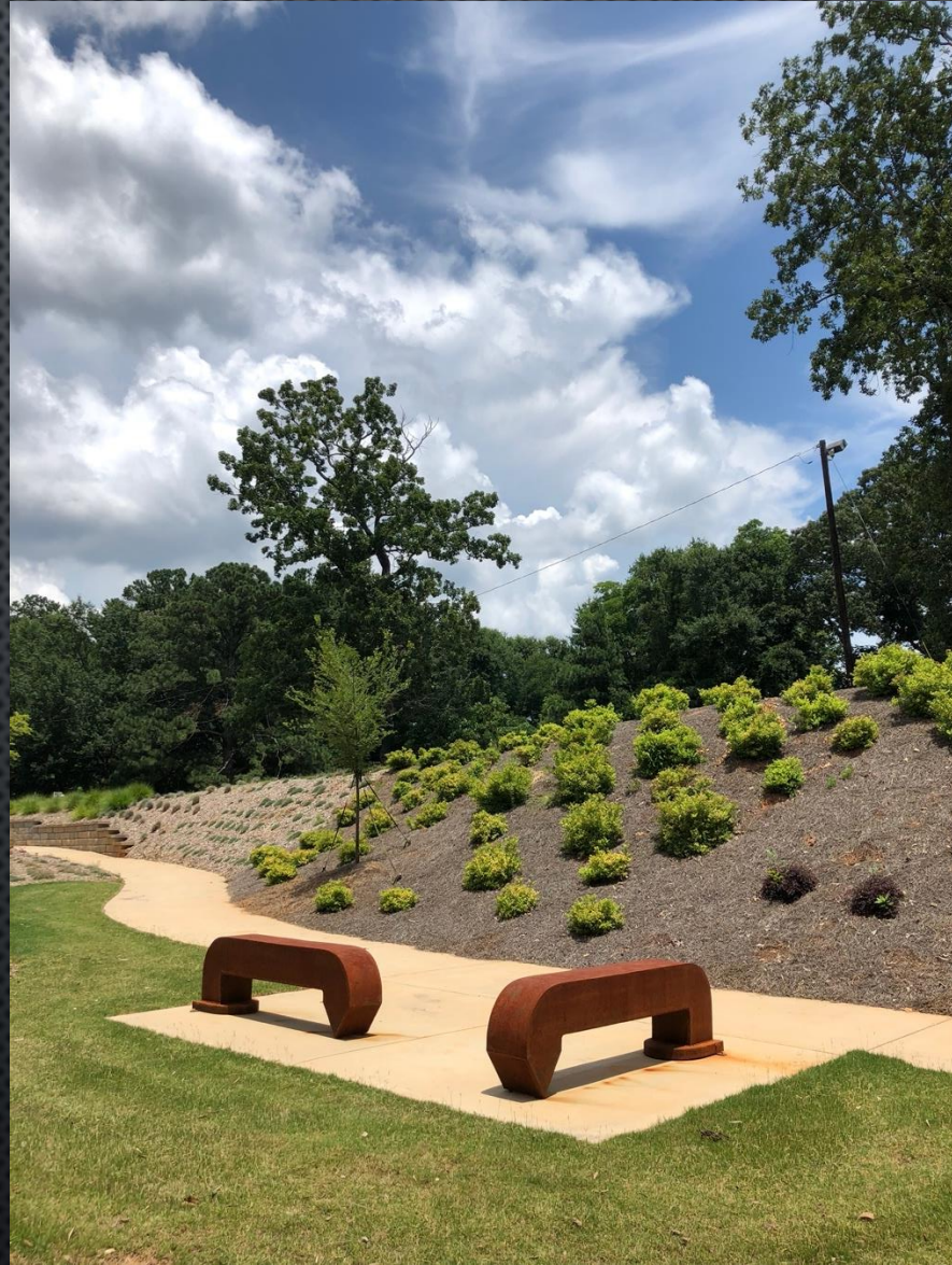
THOMAS DANIEL, RAILROAD SPIKE BENCHES , CORTEN STEEL, 2017. INSTALLATION VIEW OF BENCHES OUTSIDE OF THE SOUTHERN MUSEUM