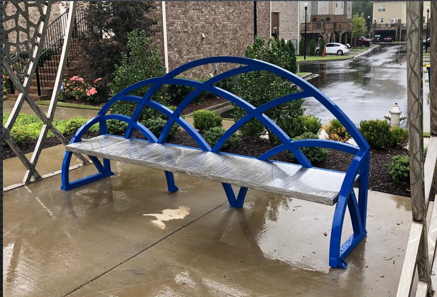
GATEWAY PARK BENCH, STAINLESS STEEL, POWDER COATED STEEL 2020. Design by CARRIE MCDANIEL