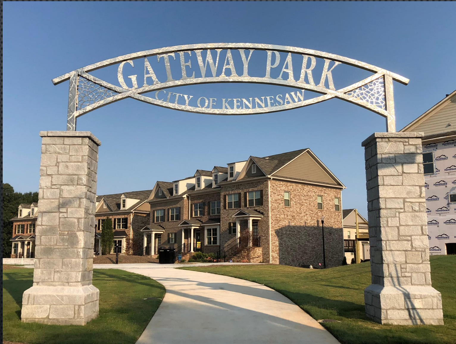
GATEWAY PARK SIGN, STAINLESS STEEL, 2018, 22' LONG, 6' TALL