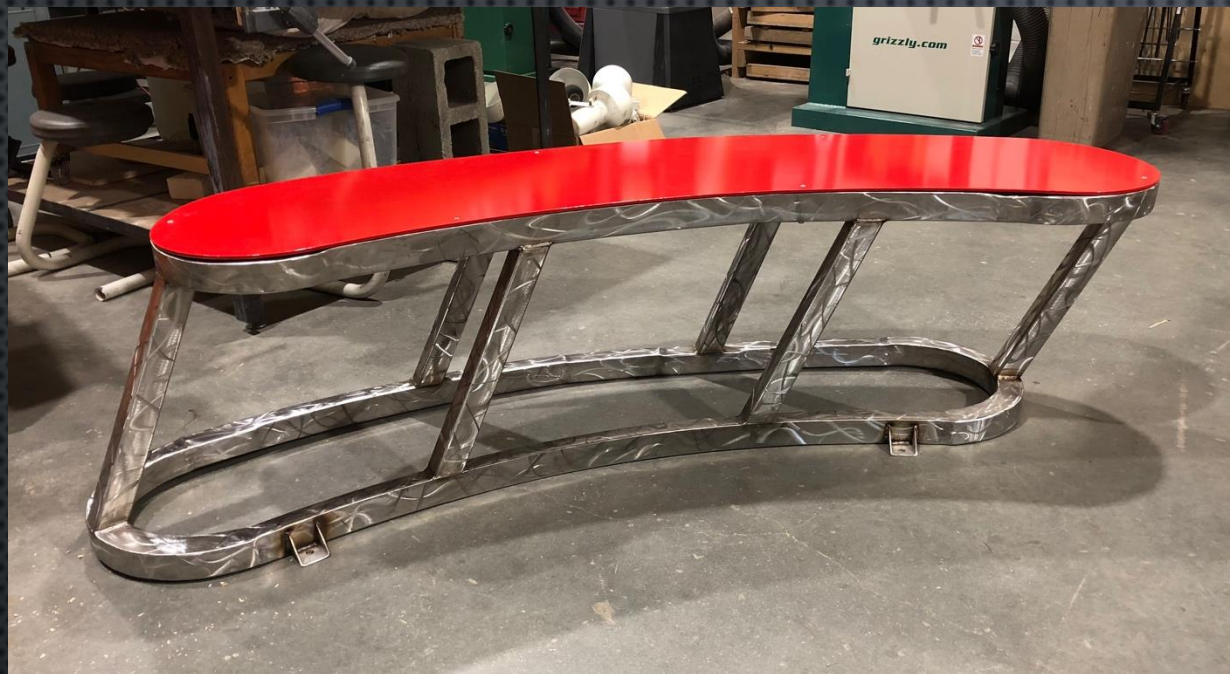
BROOKE BARRETT STAINLESS STEEL, POWDER COATED STEEL