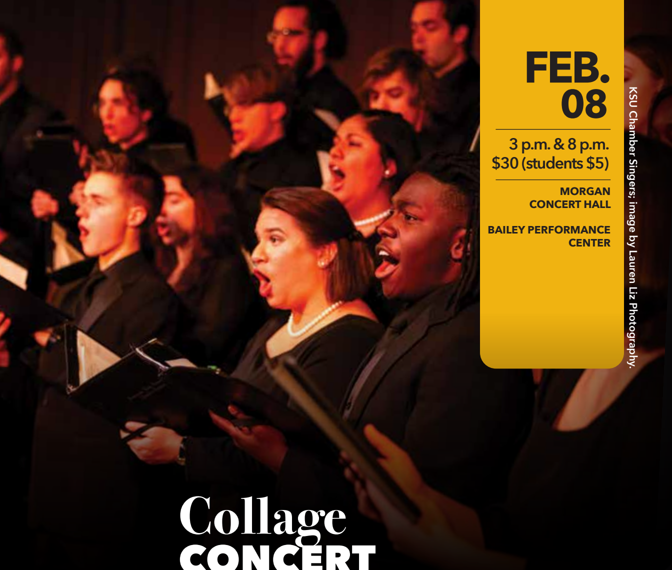
KSU Chamber Singers: image by Lauren Liz Photography.