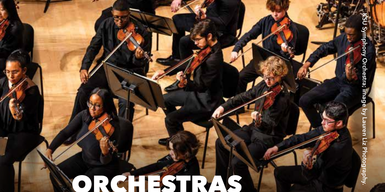
KSU Symphony Orchestra, image by Lauren Liz Photography.