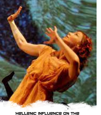
DEVELOPMENT OF EARLY MODERN DANCE