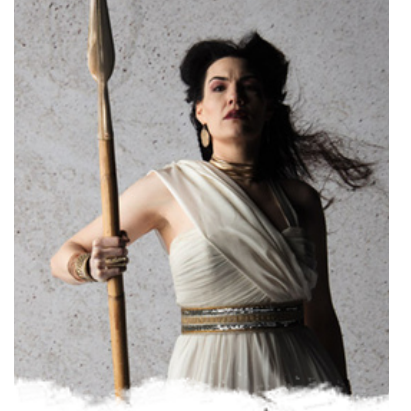
MYTHS AND MAYHEM, OPERA SCENES FROM GREEK MYTHOLOGY