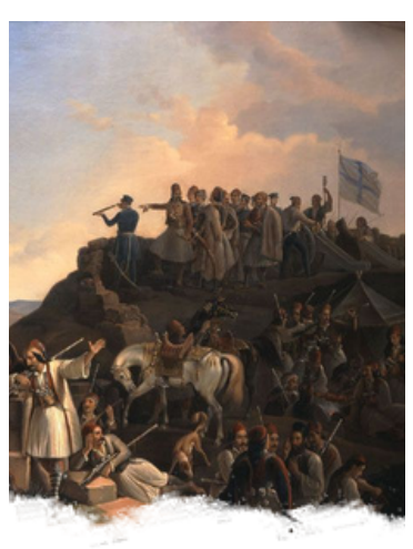
PERCEPTIONS IN THE FIGHT FOR THE GOLDEN AGE OF GREECE