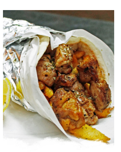
GREECE'S IMPACT ON THE RESTAURANT