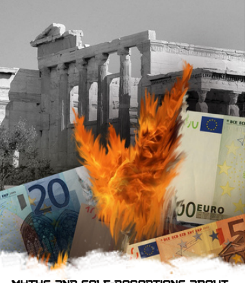
MYTHS AND SELF-DECEPTIONS ABOUT THE GREEK DEBT CRISIS